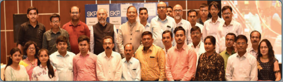
Fun @ Work @ SKP – Celebrating every occasion