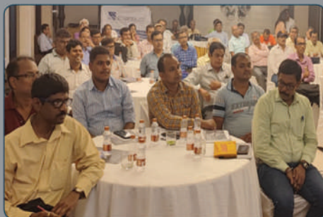
SKP Investor / Partner Awareness Meets Across Eastern Region